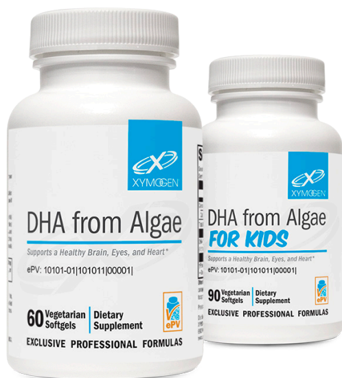
DHA from Algae is available in 60 vegetarian softgels DHA from Algae for Kids is available in 90 vegetarian softgels