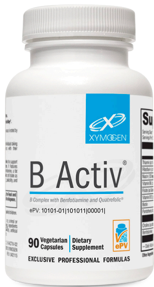
Available in 90 and 180 capsules