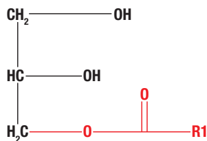
Figure 1. Monoglyceride Chemical Representation in MaxSimil Fish Oils (R1 = fatty acid)

Unique structure: One fatty acid attached to a glycerol backbone provides two polar ends that attract water and a non-polar tail end (R1) that attracts fat, thus enabling self-emulsification of the Omega MonoPure formulas.